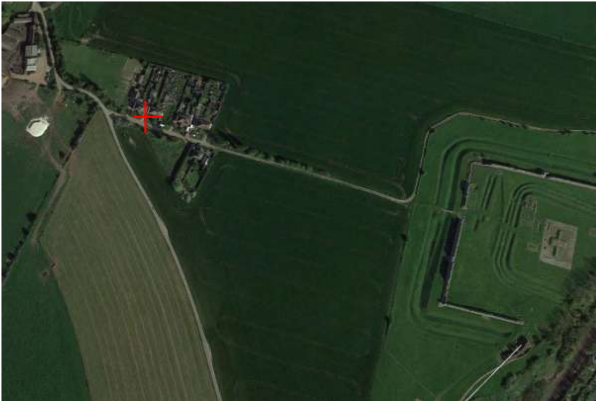
Plate 1. Aerial view of site (red target) showing the site in relationship to Richborough Roman fort.