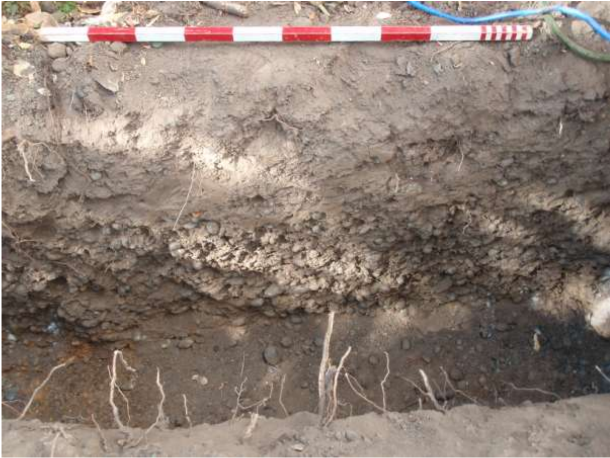
Plate 4. View of foundation trenching (looking S)