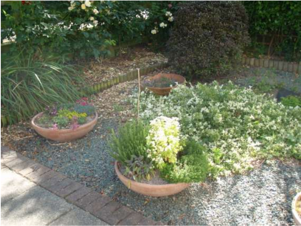
Plate 2. General view of site prior to development (looking W)