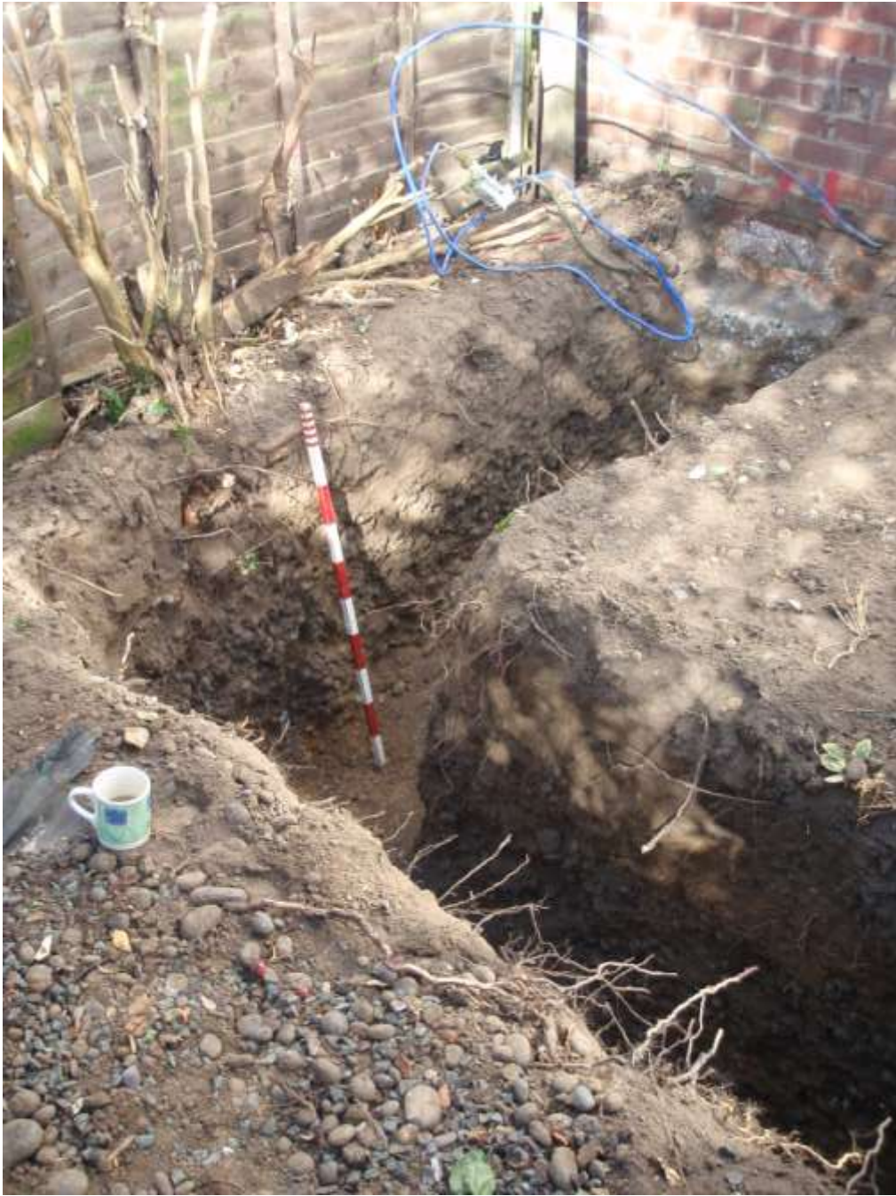
Plate 6. View of the trenches (looking NW)