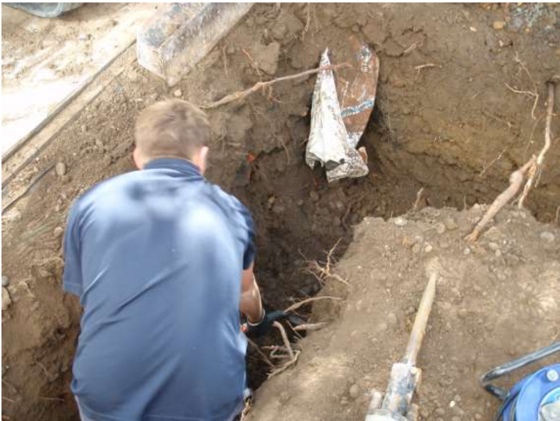
Plate 3. View of trenching (looking S)