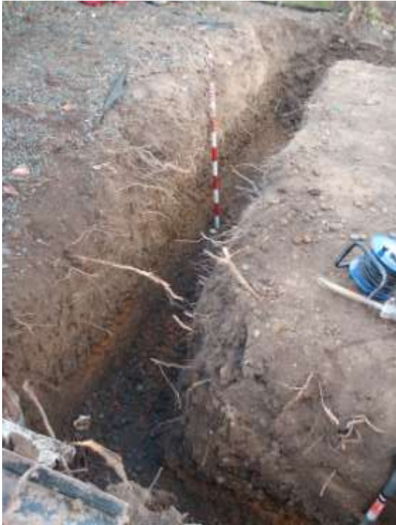
Plate 5. View of the trenches (looking N)